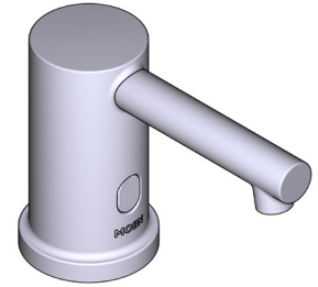
M•Power™ Align® Style Electronic Soap Dispenser